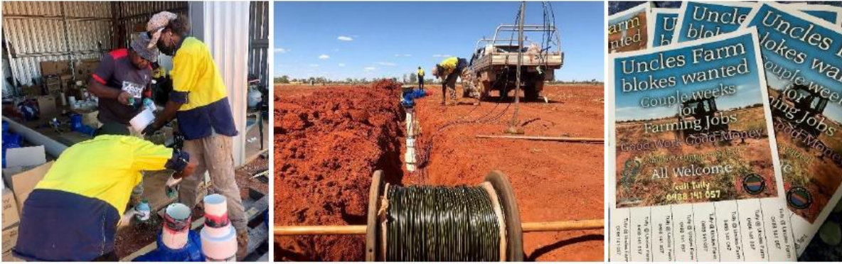
Cohort 3 preparing (left) and laying irrigation lines (middle). A leaflet produced to hire more casual workers from community (right)