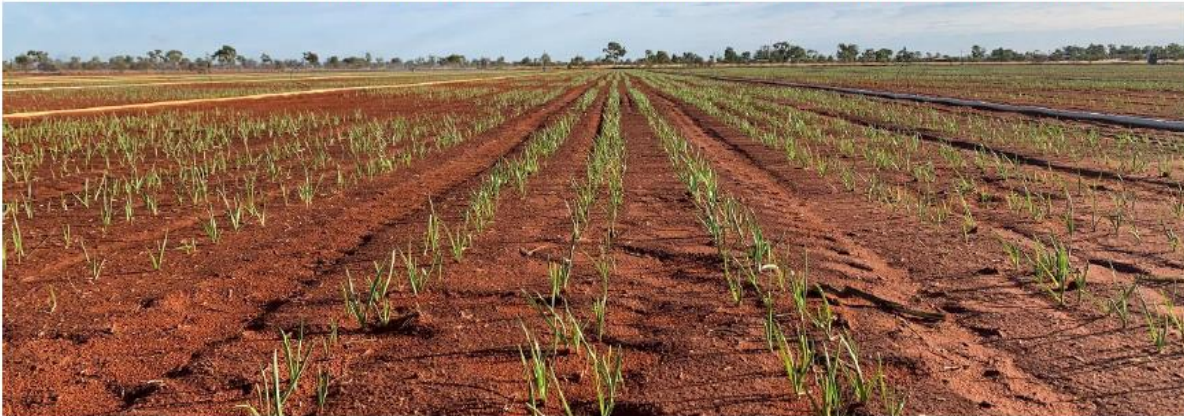
The 5ha garlic plot showing an excellent germination and growth rate one month after planting