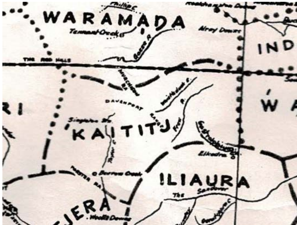
Figure 2 Kaytetye country (Tindale 1940).

Each group holds the traditional responsibility to appease and maintain connections with the spiritual Ancestors residing in their respective lands; Anerre people, for instance, hold the traditional responsibility to appease and maintain connections with the spiritual Ancestors residing in Anerre land and to protect the sacred sites on their country. Similarly, the Waake-Akwerlpe, Iliyarne and Arlpwe people are charged with upholding the same laws and customs on their respective lands. Anerre, Waake-Akwerlpe, Iliyarne and Arlpwe people have recognised native title rights under Australia law across the SWLDA, specifically: